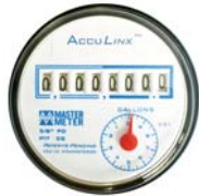
AccuLinX™ 8-Wheel Absolute Encoder