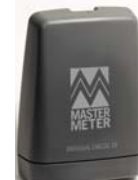
3G XTR™ Connects with existing absolute encoders