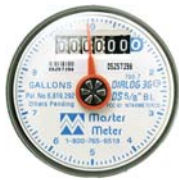
Standard 3G Register