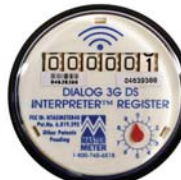
Interpreter Universal AMR Register